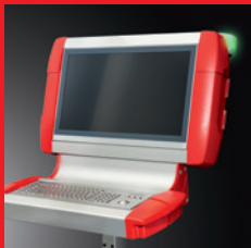
Enclosure systems – Function and design