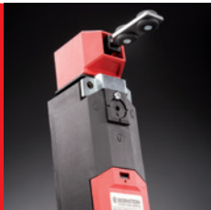
Switch systems – Economy meets safety