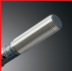
Sensor systems – Compact intelligence